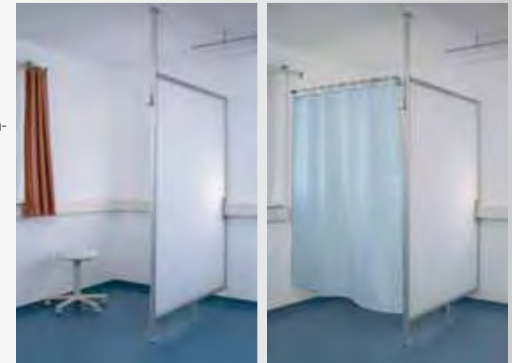
The combination ropimex®-daylight partition walls with the telescopic system offers the unique possibility of being able to maintain the windows in accessible and functional form.