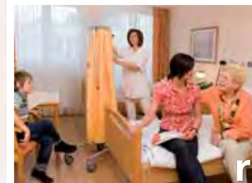
Mobile screen with folded-down telescopic arms.

The mobile screen '95 is ready for use in a few seconds and quickly back in park position. Its ease of motion, minimum weight, and high stability guarantee simplified use. The mobile screen equipped with one or two telescopic arms is ideal for mobile screening, e.g. for patient accommodation in corridors, in multi-bed rooms, in the emergency department or on the gynaecology seat.