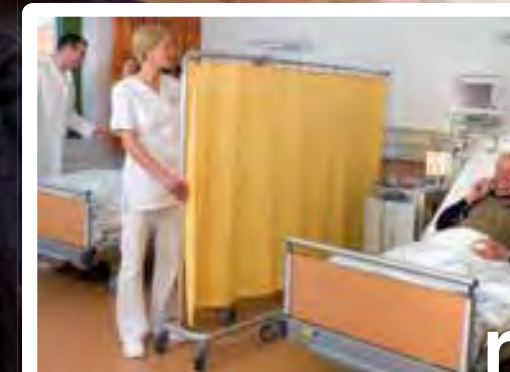
Mobile screen in hospital.