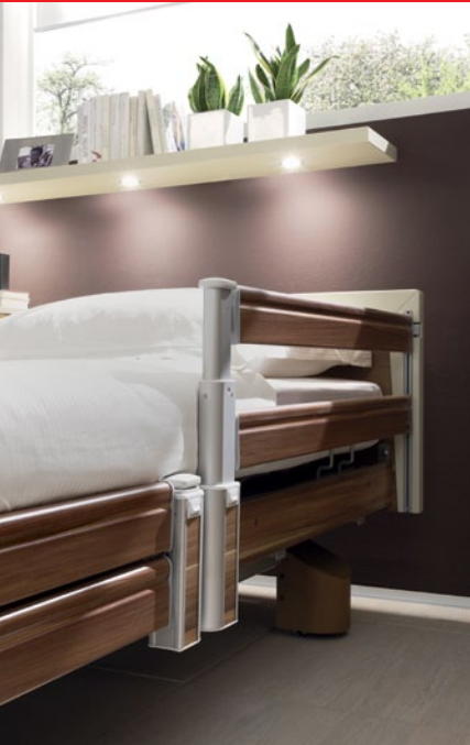
Side rail model long splitted