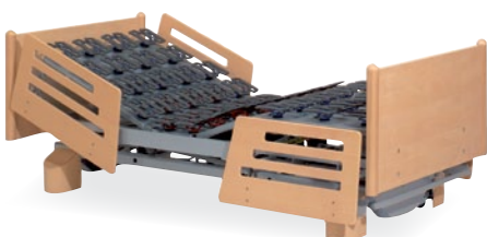
practico lie low with moving along side rails at the head end