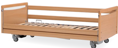
Model with open castors

The cosy wooden covering, the extensive variation of the lying surface and side rails grant an unrestricted comfort of living and care. The standard central braking of all four castors can be operated in every height. Besides its low entrance height the practico offers enough space for a lifter. The wide range of end panels and interesting colour combinations fulfill all requirements.