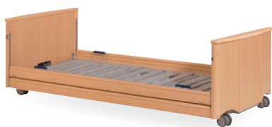
ancona lie low, with a height adjustment of 21–61 cm lying surface with ripoplan

The lie-low bed for optimal prophylaxis from falling out of the bed.