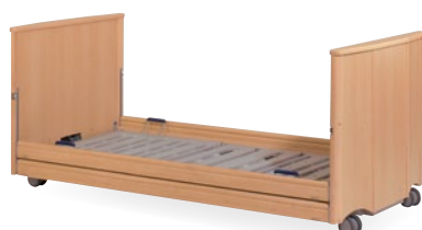
ancona lie low, with a height adjustment of 21–81 cm lying surface with ripoplan

The extremely low lying-height of only 21 cm of the ancona lie-low bed nearly excludes, especially in conjunction with the roll-off mattress, injuries due to falling out of the bed. Therefore even active patients are protected, as they will not climb out of the bed and possibly harm themselves by that.