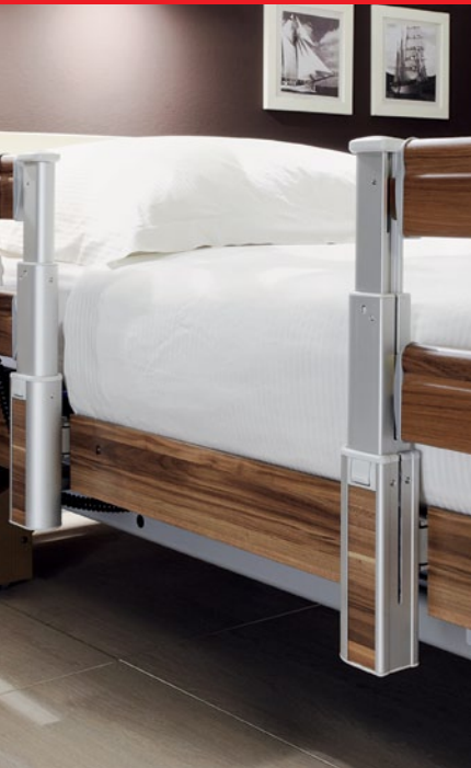
Side rail model short splitted