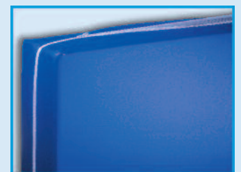
Including high quality PROMUST-PU-full cover