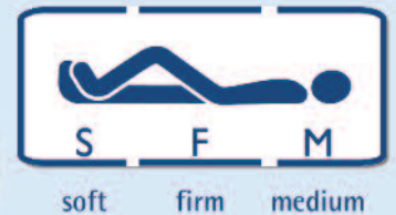
Three zones in various hardness.